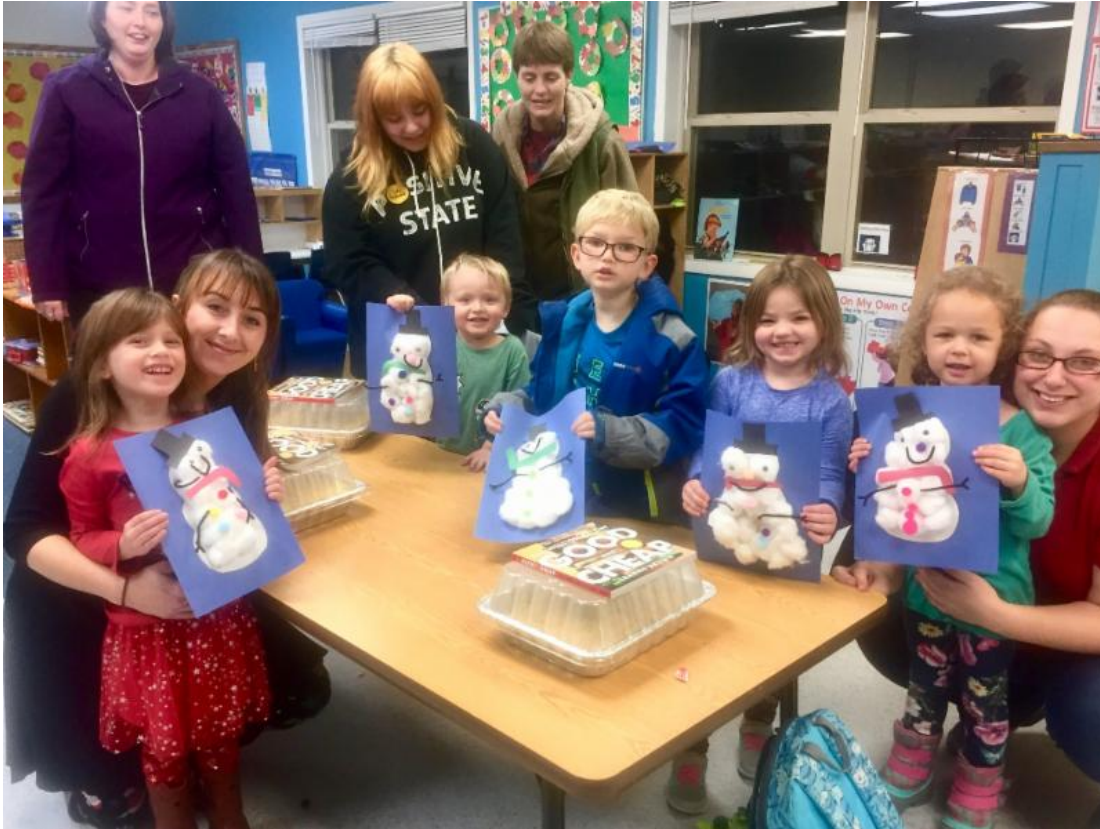
Bennington County Head Start in Pownal held a fun Make-it/ Take- it event for their families. They made snowmen and delicious butternut squash mac-n-cheese.

Start, with sites in Bennington, North Bennington, Pownal and Manchester, serves 3-4 year olds, providing early education classes and family opportunities to Bennington County residents to promote school readiness and strengthen families.